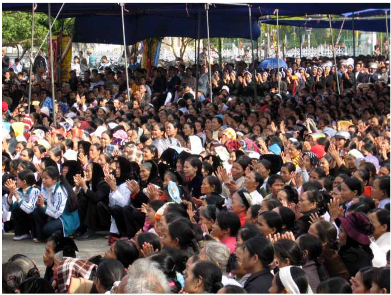
Mass of the Vietnamese Martyrs, celebrated in Phuc Nhac, Vietnam